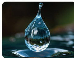
Minimising Use of Water