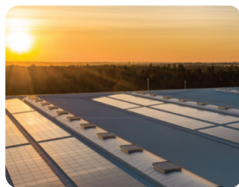
Solar Powered Warehouse Panels