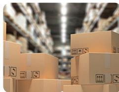
Reusing Shipping Containers